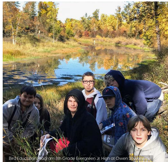
Bird Education Program 8th Grade Evergreen Jr. High at Owen Sowerwine