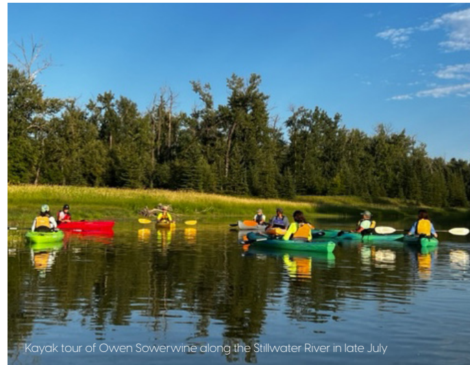
Kayak tour of Owen Sowerwine along the Stillwater River in late July

In May and July, Flathead Land Trust, with partners Flathead Audubon and the Flathead Lakers, hosted 16 public tours of the Owen Sowerwine property in order to build support for purchasing a conservation easement of the 405-acre property. Over 150 people attended the tours, which included hikes of the mainland along the Stillwater