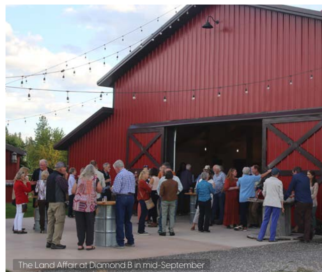
The Land Affair at Diamond B in mid-September

On September 13th, we hosted over 95 attendees at the beautiful Diamond B for our annual event, The Land Affair . Not only was it a perfect early fall evening where we got to catch up and celebrate with our good friends and supporters, but we also raised over $17,000 for conservation of our open spaces and