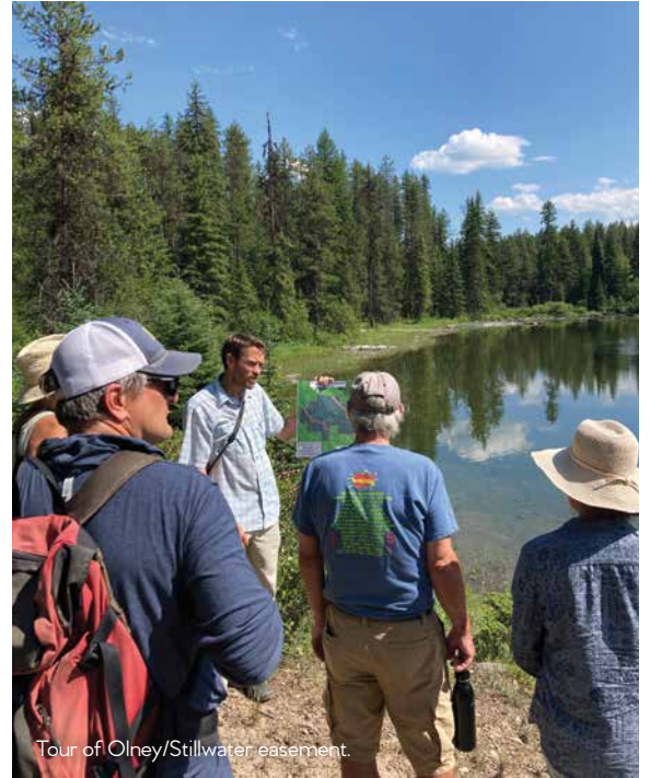
Tour of Olney/Stillwater easement.

Even though we didn't get to host our annual fundraising event this August, we did offer several rewarding and safe ways to share our conservation work outside with many of you. Over 14 tours of the Bad Rock Canyon Conservation Project property were given to the public showing over 200 people the project between May and October in partnership with the Flathead Lakers, Montana Fish, Wildlife and Parks, Gateway to Glacier and others. We also co-hosted a Bike and Bird in Lower Valley with Flathead Audubon on May 15 with over 46 bikers and birders attending. In July, we hosted three tours of the new Olney/Stillwater conservation easement along with the landowner, F.H. Stoltze Land & Lumber. And finally, we were excited to continue our Bird Education Program this year. In September, we connected 75 seventh graders from Evergreen Jr. High to the world of conservation, birds and sandhill cranes with multiple classroom presentations and field trips at the West Valley Wetlands.