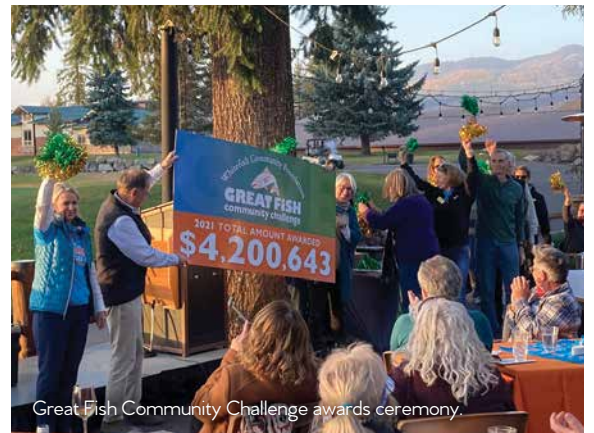
Great Fish Community Challenge awards ceremony.