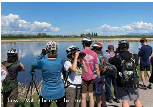
Lower Valley bike and bird tour.