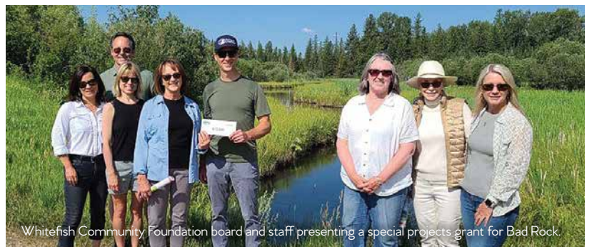
Whitefish Community Foundation board and staff presenting a special projects grant for Bad Rock.