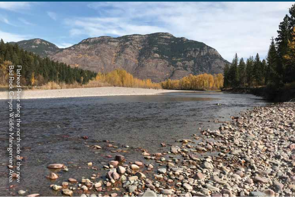
Flathead River along the north side of the new Bad Rock Canyon Wildlife Management Area