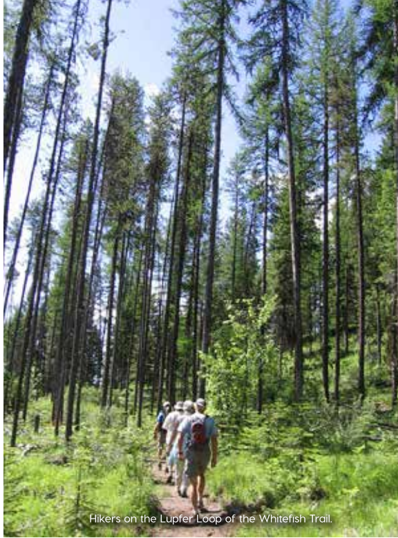
Hikers on the Lupfer Loop of the Whitefish Trail.