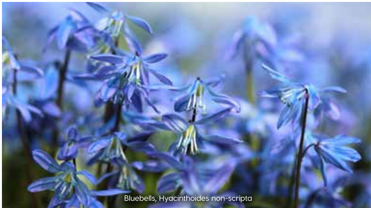
Bluebells, Hyacinthoides non-scripta

on a 570-acre conservation easement held by Flathead Land Trust which was conserved in partnership with the Stillwater Land Company in 2002. The property was conserved to protect its native wetland and intact forested habitat important for a rich diversity of wildlife species. Mike Goguen purchased the property in 2006 and entered into a land exchange with the State of Montana in 2009 which resulted in the present trail system being established when it became State land. The Lupfer trail is 4 miles long and includes a 3-mile loop through forest interspersed by wetlands and a spur trail to a scenic viewpoint of the Salish Range and Stillwater Valley.