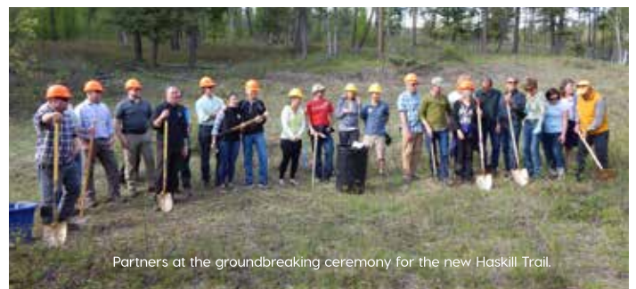
Partners at the groundbreaking ceremony for the new Haskill Trail.

This is the second project Flathead Land Trust has been involved with which has facilitated the Whitefish Trail system. The Lupfer Loop of the Whitefish Trail is located