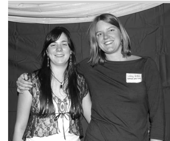
the FVCC Scholarship Awards Reception