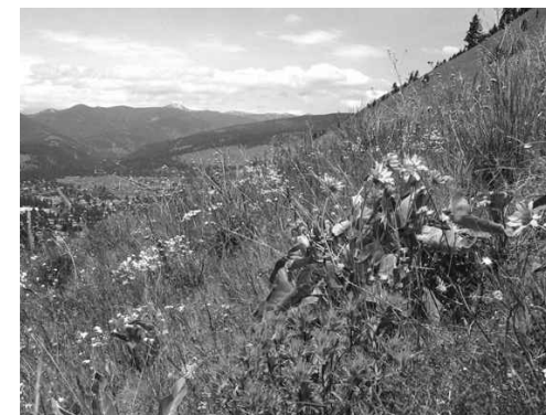
View from Missoula's Mt. Jumbo

One thing is clear, we have an opportunity to provide options to rural landowners that will benefit all of us by maintaining the character of the Flathead Valley