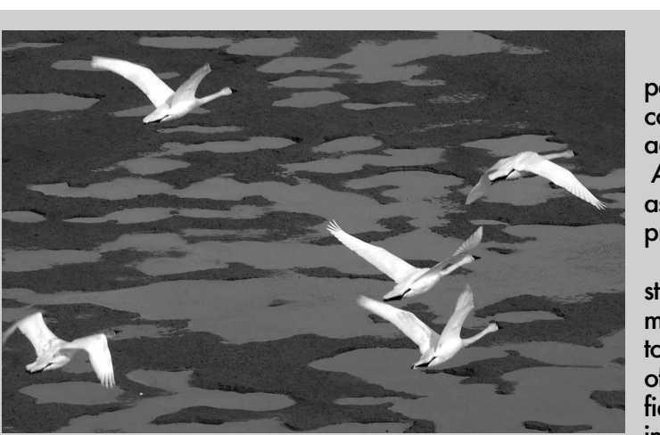
Tundra Swans stop in for refueling on Flathead Lake' North Shore.

determined by the people who live there and have the