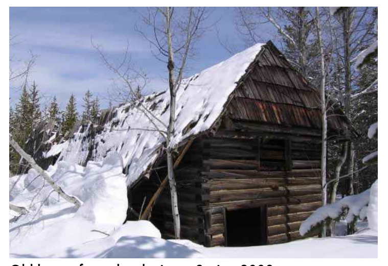
Old barn after a hard winter, Spring 2008.

Today, the descendents of Helen and Orville continue to enjoy the family home during summer visits. The land is still wild and provides natural habitat for many of the same native plants, fish, and wildlife that abounded in the time when L.O. Vaught first came to love it. Common loons, bald eagles, raptors, bull trout, westslope cutthroat trout, grizzly and black bears, mountain lions, grey wolves,