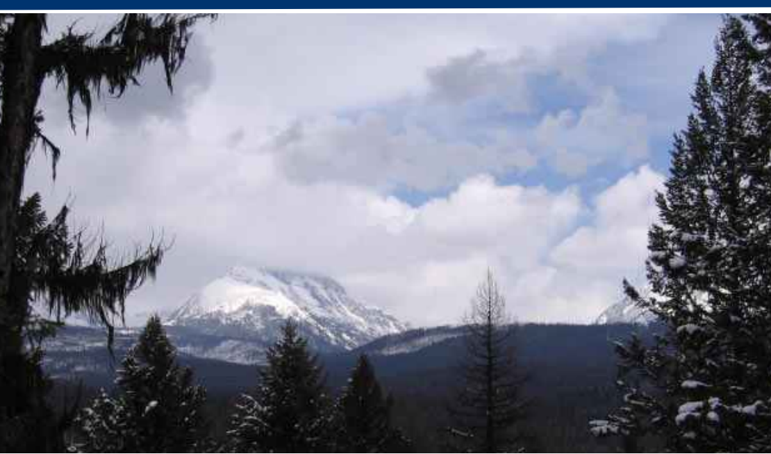
View into Glacier National Park from the Foreman property.

The bond measure has been designed to be transparent to the public, with accountability built right