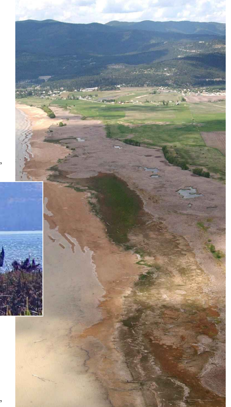
Aerial view of Flathead Lake's North Shore.

The North Shore State Park/WMA would be a keystone project within the River to Lake Initiative, a collaborative effort that focuses on conservation along the main stem of Flathead River to the North Shore of Flathead Lake. The primary goal of the initiative is to