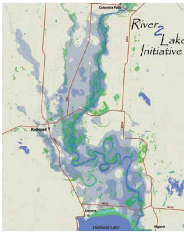
Overview of the River to Lake Initiative focus area. For a detailed map including protected lands, visit www.flatheadrivertolake.org .